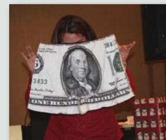
Some great and some "interesting" presents showed up in the Pollyanna...