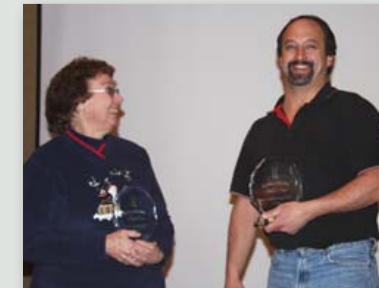
Some trophies were handed out to these and others