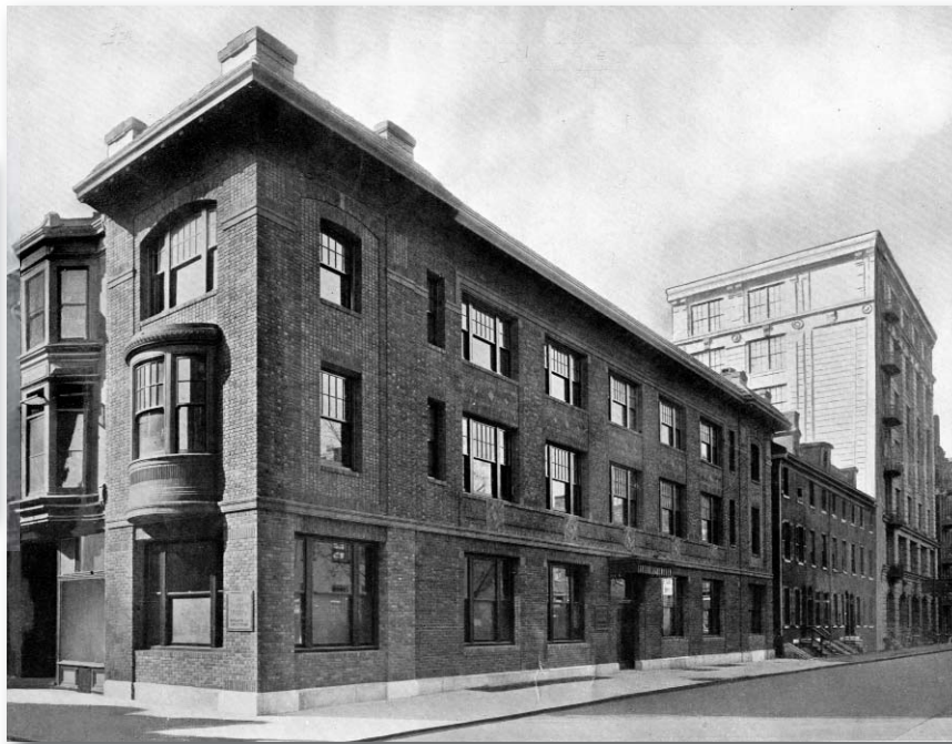
Irwin & Leighton's First Office 12th and Cherry Streets, Philadelphia