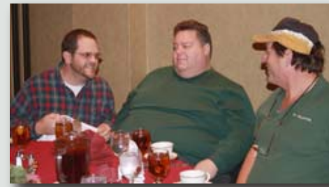
Employees gathered to relax and enjoy a great meal.